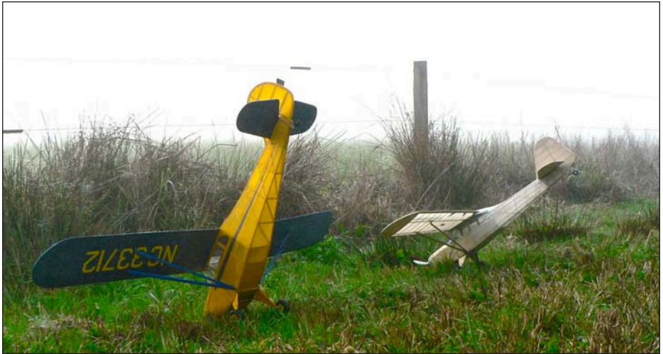
The author's Aeronca Chief and Auster with wings and tail kept out of the moist grass, in the wait for the mist to lift.