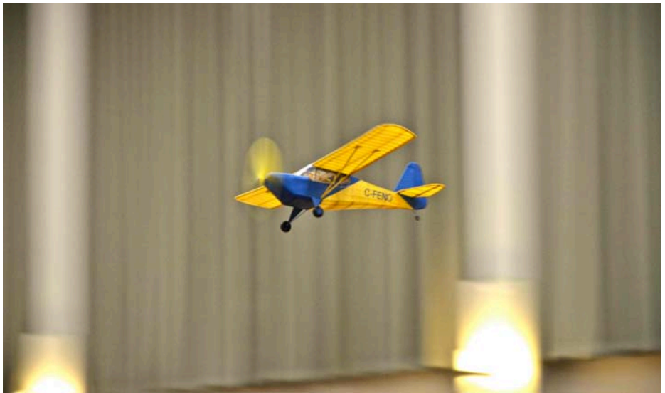
Upper: Stan's KK Cessna gaining height in easy circuits of the hall.