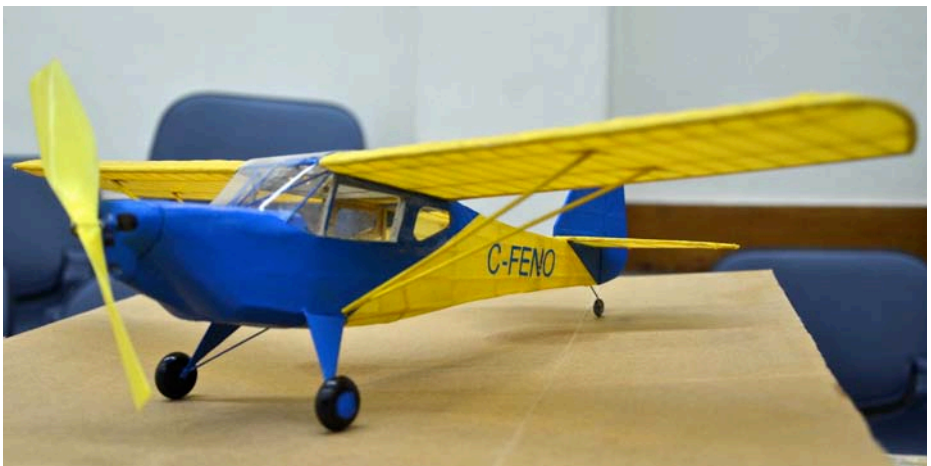
Top: Keith Trillo's Fike for Peanut Scale, before the evening's flying.